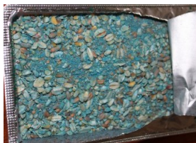
Rodenticide (rat poison)